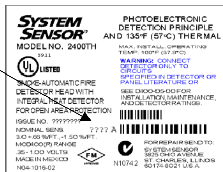
Typical Product Label