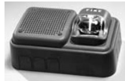
SP2R1224MC mounted with BBS-SP2R